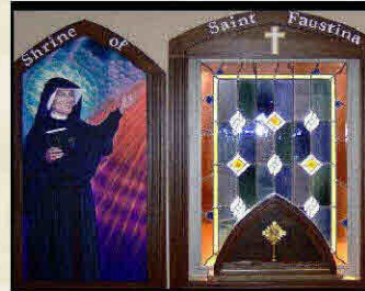
Painting and 1st Class relic of St Faustina

All are invited! Come join us in the celebration of the Holy Mass in honor of St Faustina and through her intercession receive the many graces from the Mass. After the blessing of the Shrine there will be veneration of our 1st Class Relic of St Faustina and Icon of The Divine Mercy.